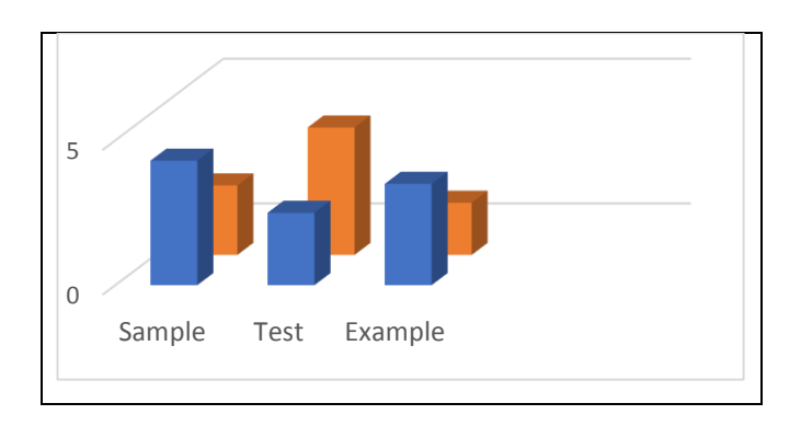
Figure 3.3: Example of figure